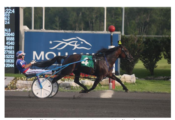
Thatll Be Franny

There are nights at Mohawk when early speed absolutely can't lose. The key is being able to recognize it early in the card to take advantage of it at the windows. Most of the betting public don't see it and don't adjust their wagers accordingly. One of those nights that sticks out in my mind is July 18<sup>th</sup> of the 2015 summer meet. The warm, humid night kicked off with 11-year-old pacing mare Thatll Be Franny cutting some swift fractions and leading all the way to an open-length 1:50 2/5 win in a non-winners of $6,800 last five starts conditioned race. So do we scream "BIAS!" based on that one result? Of course not, but, my spidey senses were certainly tingling when an 11-year-old mare shattered her previous lifetime mark while leading all the way setting serious splits.