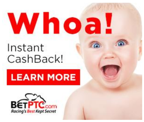
Enter promo code HANA at sign-up

Again the board was screaming bet the 4, bet the 4, you just had to be listening. What surprised me though was that even seasoned players did not have a grasp of the tote system and how it can help you and what it says. A horse at 9-5 that should be 4-5 is dead on the board or not bet right. A horse that should be maybe 12- or 15-1 as the 4 should have been is live. This is never truer than in a maiden special weight contest with a few first-time starters. While I don't make my own morning line or encourage others to do it, I do know what horses should go off at post time.