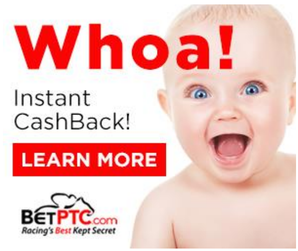
Enter promo code HANA at sign-up

the spring meeting look for those coming from Churchill Downs or Fair Grounds.