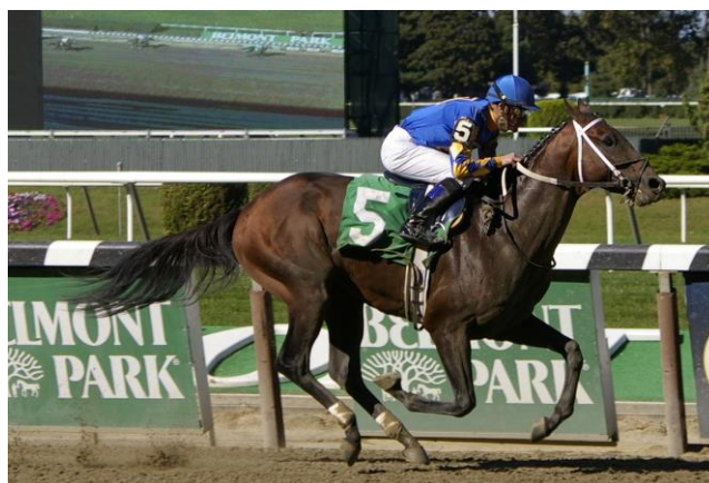
With racing nearly concluded at Saratoga, the NYRA circuit heads back to Belmont