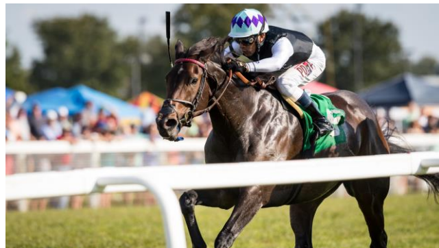
Racing at Kentucky Downs

bet. At 14 percent, the Kentucky Downs' Pick 4 is among the lowest in the country. By comparison, most major tracks are at least 20 percent, some 24 percent or higher.