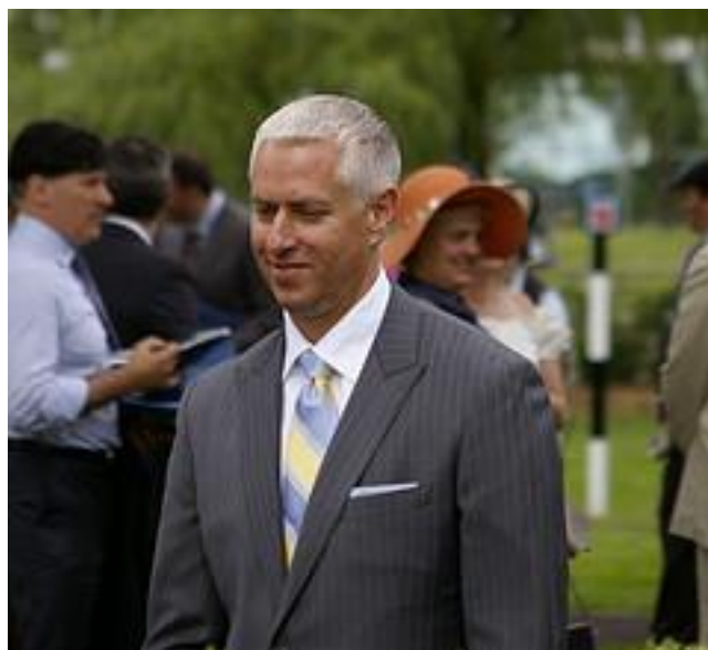
Todd Pletcher is among the big-name trainers who could have horses at the Kentucky Downs meet