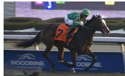
Summer Applause as a two-year-old

Honestly, he may be sending out a longshot winner. Summer Applause has, in her last 10 races, been sent out at distances at 8.5f or greater, compiling a 10:4-2-0 record. But her sire, Harlan's Holiday, has progeny with an average winning distance (AWD) of exactly 7.0f and Summer Applause sports a 1-1 record at the distance. In a race with some very speedy ladies, her stalking style may put her in front of fading frontrunners with enough in the tank to hold off closers. She will be a higher price in this field, but her placement makes much more sense than her running line suggests.