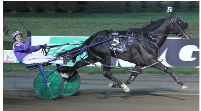
Racing Hill

On the 3-year-old side, Racing Hill rebounded from a flat elimination effort, rallying by battling leaders Check Six and Lyons Snyder turning for home and holding on over Manhattan Beach late to take the Colt Pace in 1:48 flat. Racing Hill has enjoyed an excellent season, with this victory joining triumphs in the Adios, Messenger, Hempt, and Tattersalls, and he will merit consideration for year-end honors in the United States.