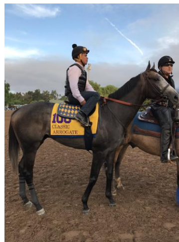
Arrogate

A: Arrogate. I don't think his Travers was a fluke, and Baffert had no problem going straight to the Classic from the Travers last year...but I'll be rooting for Chrome.