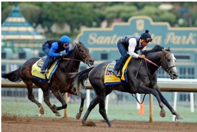
Jonathan says that Arrogate (outside) is his choice in the Breeders' Cup Classic