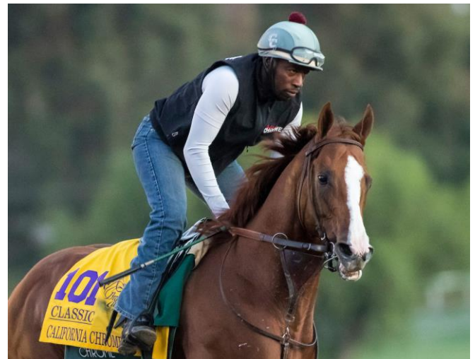
Melissa Nolan prefers California Chrome in the Breeders' Cup Classic

A: Chrome. If racehorses were investments, Chrome would be a Treasury Bill (reliable performance and low risk) while Arrogate would be an IPO on a Silicon Valley start-up (risky with unknown potential).