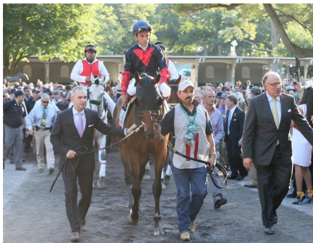
Tonalist