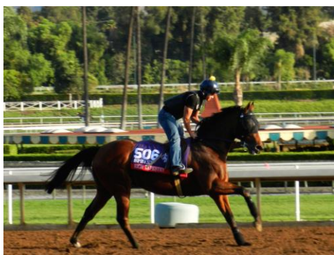
Rich Tapestry

1. What horse are you most excited to bet in the Breeders' Cup & why? I'm most excited to bet Rich Tapestry. I've seen him run many times overseas and while I didn't know how he'd run in his prep coming off the layoff, I was pleasantly surprised with the result. In what I've seen of his works, he appears to come out of that race well and I believe he was drawn ideally here. With the primary speed to his inside, he should be able to slot in behind them while the speed horses who were drawn outside press forward. I really see him getting the run of the race in there.